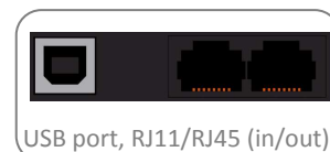
USB port, RJ11/RJ45 (in/out)